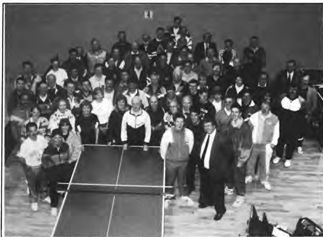
Coaching course at Milton Keynes Table Tennis Centre

He provided a clear insight into the teams preparation at Lilleshall prior to the championships. All controllables, i.e. accommodation, food, playing facilities and equipment, were excellent. A good team spirit existed throughout the even despite the views of many spectators. There was obviously a slight disappointment at only receiving a bronze but our players are perfectionists.