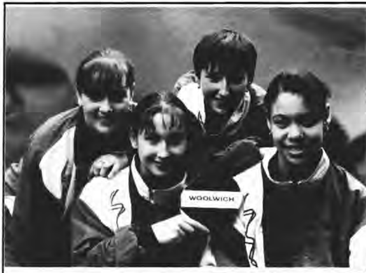
Fellows Cranleigh Girls

and Falkirk (boys) taking the team awards.